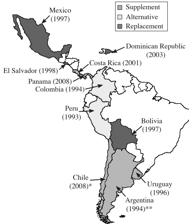
FIGURE 1. INTRODUCTION OF INDIVIDUAL RETIREMENT ACCOUNTS (IRAs) IN LATIN AMERICA, RELATIONSHIP OF IRAs TO EXISTING SYSTEM